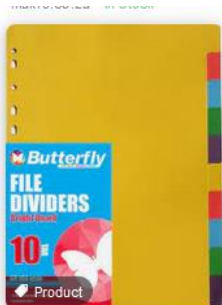
Butterfly A4 File Dividers B...

Dividers (pack with 12 or more dividers (see picture below))